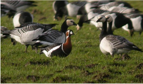
Red-breasted goose, amongst Barnacle geese (Darren Robson)