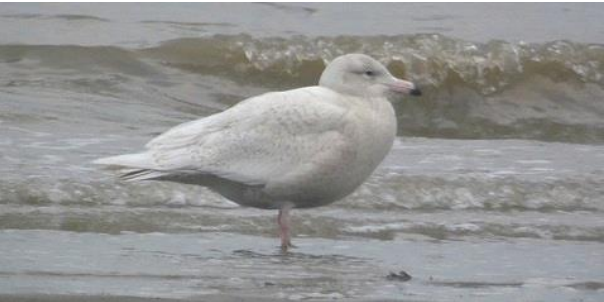
Glaucous Gull (Craig Shaw)