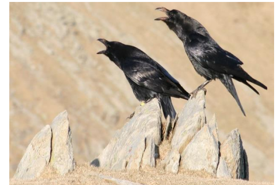
Ravens